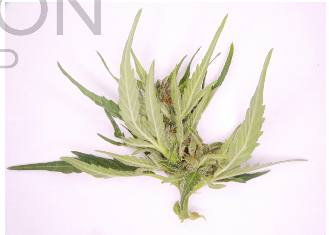
Sample Photo: Auto Pivot